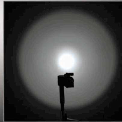
47 Lumens (13hrs)