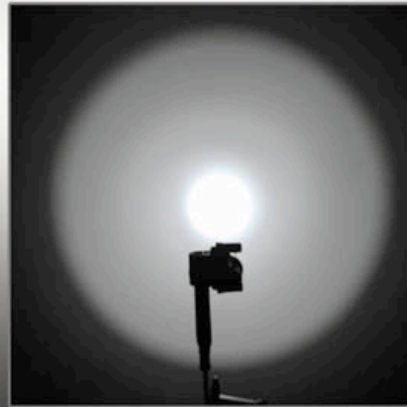
94 Lumens (5hrs)