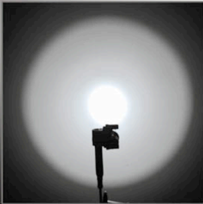
180 Lumens (2 hrs)

The beamshots for each output of LD20 (use two 2500mAh AA batteries)