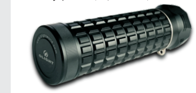
Battery pack (Optional)