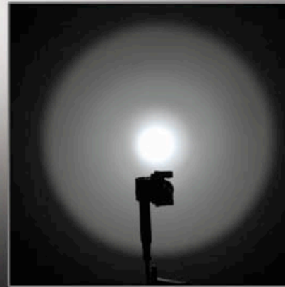
70 Lumens (8hrs)