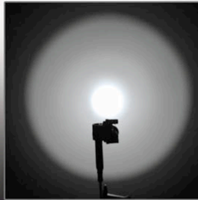
117 Lumens (4hrs)