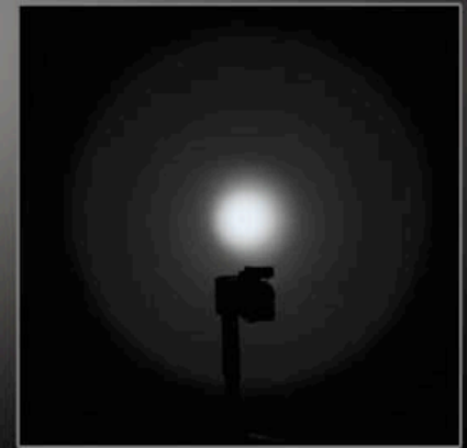
9 Lumens (65hrs)