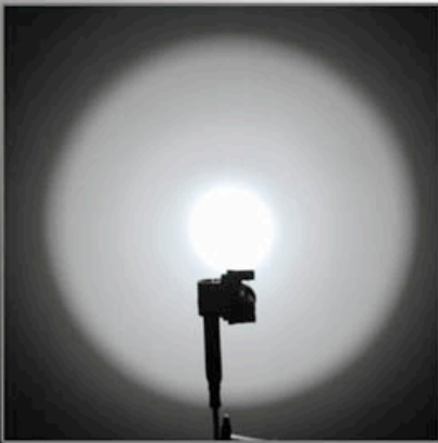
220 Lumens (1.5 hrs)

The beamshots for each output of PD30 (use two 1200mAh CR123A lithium batteries)